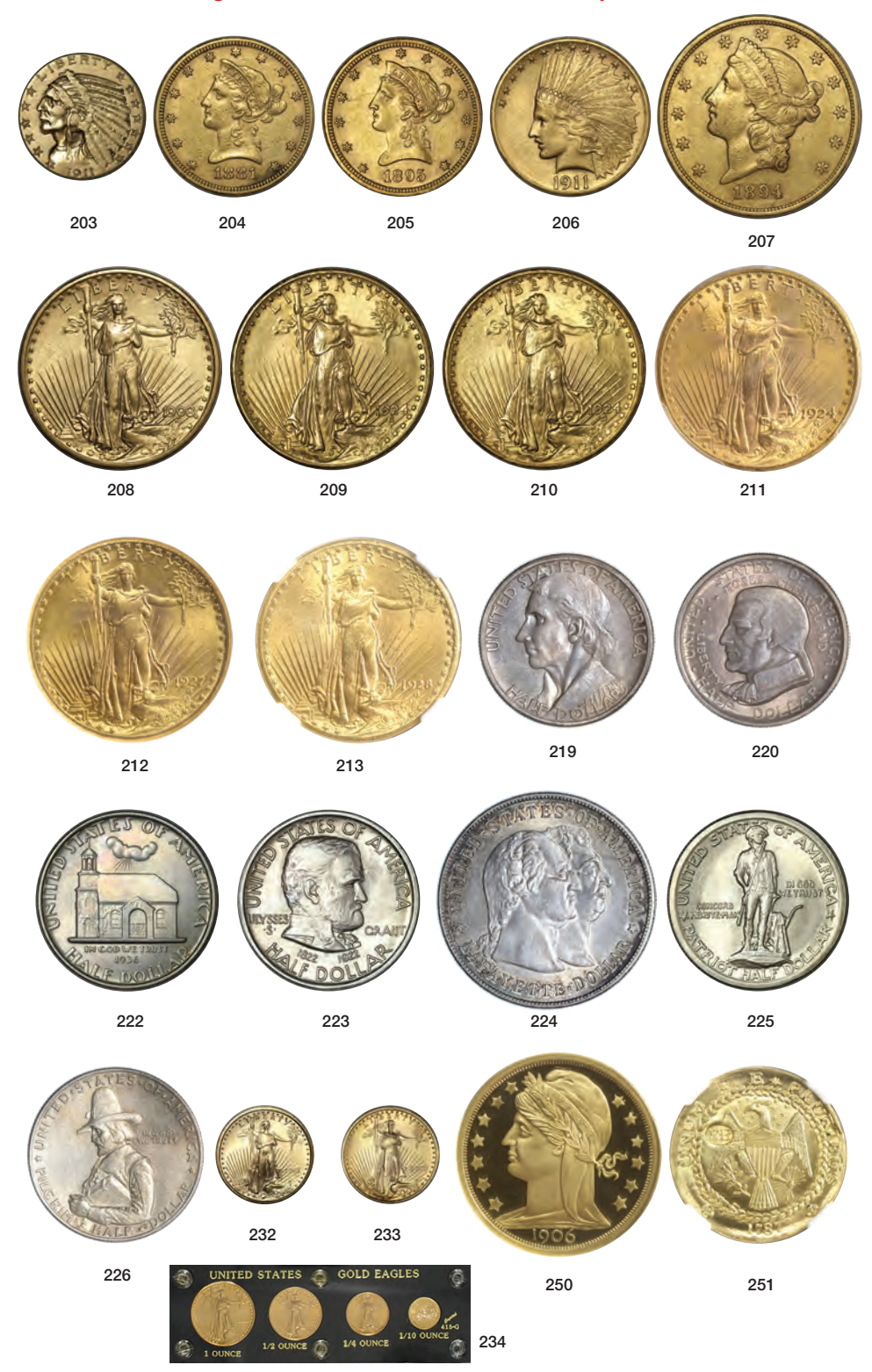
Dutch Country Auctions Coin & Currency Sale #34